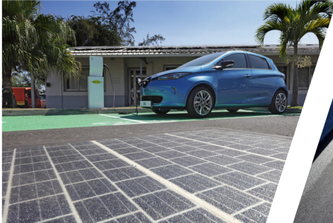
Turnkey solution (charging station)