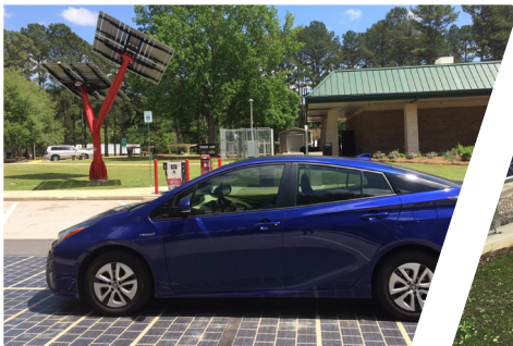
Direct use (tourist office)