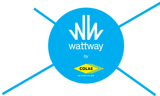
West Point, GA, USA - 50 m 2