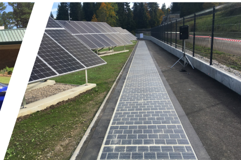
Producing electricity for electricity syndicate

For further information contact@wattwaybycolas.com + 33 1 76 52 10 25